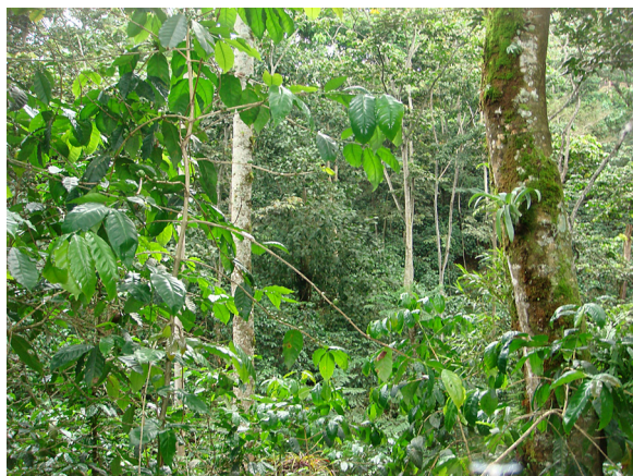
Fig. 4. A structurally complex coffee agroforestry farm in Chiapas, Mexico.

Although many agroforestry commodities like coffee and chocolate are not essential food staples, like basic grains or vegetables, they nevertheless represent an important part of the economies of many poor countries, supporting millions of people throughout the tropics. From an ecological perspective, coffee and cacao are special in that both occur as understory plants and grow well under shade trees, creating an “agroforest” that structurally resembles the forests they replaced (Fig. 4: Fig. 1 quadrants A and C). Coffee and cacao agroecosystems are becoming emblems of managed ecosystems that can be planned to contribute to sustainable agriculture in a variety of contexts. First, as a repository for biodiversity, they sometimes house levels of biodiversity that rival nearby native systems (Perfecto et al., 1996). Second, shaded coffee and cacao systems can contribute a high quality matrix element in landscapes where biodiversity is maintained through dispersal dynamics that promote the persistence in remnant patches (Perfecto and Vandermeer, 2008). Third, because the physical structure of agroforests mimics that of native forests, they are thought to provide a buffer to some of the negative impacts expected under global climate change (Vandermeer et al., 2010). Fourth, the biodiversity harboured within these agroecosystems and the adjacent native habitats contribute to ecosystem services such as pollination and pest control (Vandermeer et al., 2010).