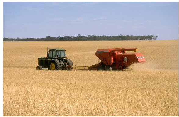
Fig. 3. Temperate eucalypt woodland replaced by grain cropping in Australia.