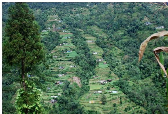
Fig. 5. Small scale farming in the Eastern Himalayas.

The striking differences between the systems (i.e. cereals in a cleared woodland and coffee in an agroforest), illustrate the point that options for better biodiversity outcomes in agriculture depend on the inherent contrast between the productive land-use options and the pre-agricultural ecosystem (Fig. 1). In regions where trees have made way for annual cropping systems the contrast is so great that there will be few options for significant biodiversity outcomes in the agricultural matrix, because the endemic forest or woodland-dependent biodiversity is not supported by the agricultural habitat. It becomes especially important in these circumstances to ensure that interpatch dispersal can occur, to sustain the remnant populations (Perfecto et al., 2009). In contrast, where complex agroforests replace native forest, it is more likely that agriculture can approximate structurally and spatially complex environments that are productive and support biodiversity (Clough et al., 2011; Perfecto and Vandermeer, 2008). Explicit recognition of the diversity of relationships between production and biodiversity is the first step in balancing trade-offs in different agro-ecological systems. Clearly, not all land-use options or technologies are equivalent in their impact (on production or biodiversity) under different social, economic, biogeographic and ecological contexts (Tscharrntke et al., 2011).