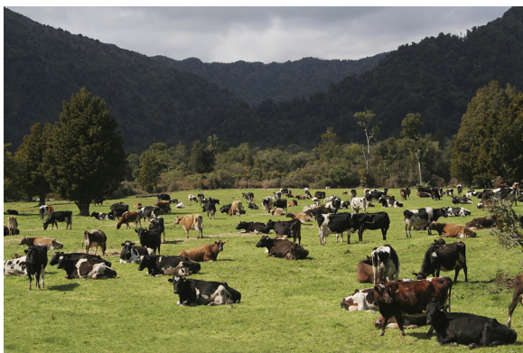
Fig. 2. Intensive dairy farming in New Zealand.